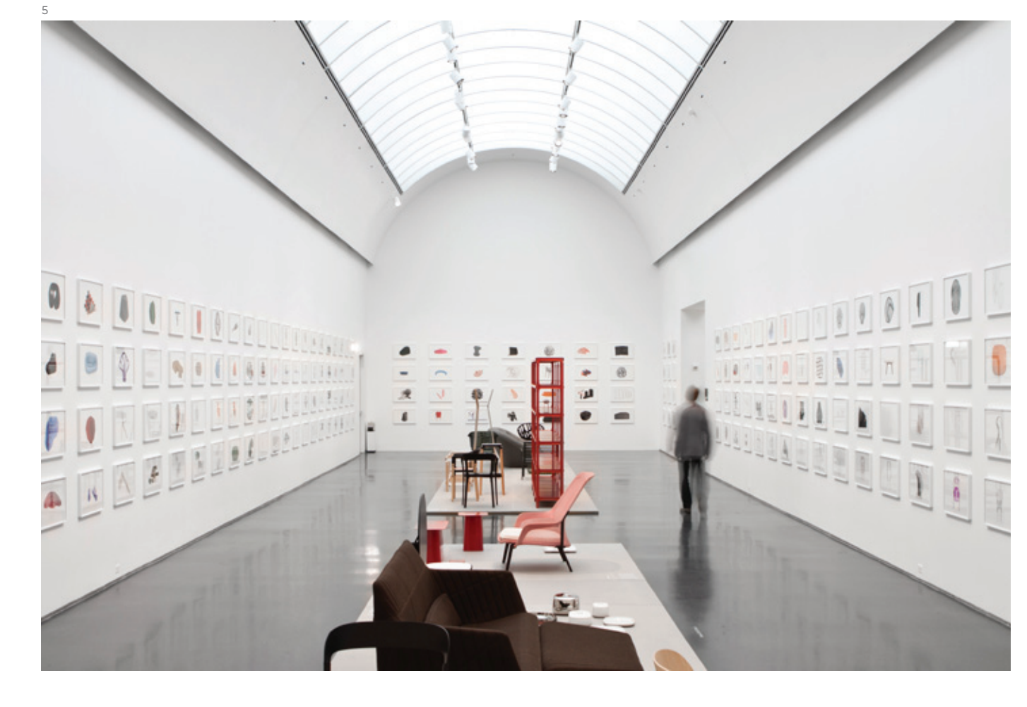
4 - The Album exhibition, presented at the Vitra Design Museum Gallery, Weil am Rhein, in 2012. Its main focus was on the Bouroullecs' drawings

On a magnificent scale, this is what their London Design Festival installation at the V&A in 2011 achieved: Textile Field was a 30m-long platform in the museum's Raphael Court, upholstered in thick Kvadrat fabric that echoed in its pixilated, panelled colour