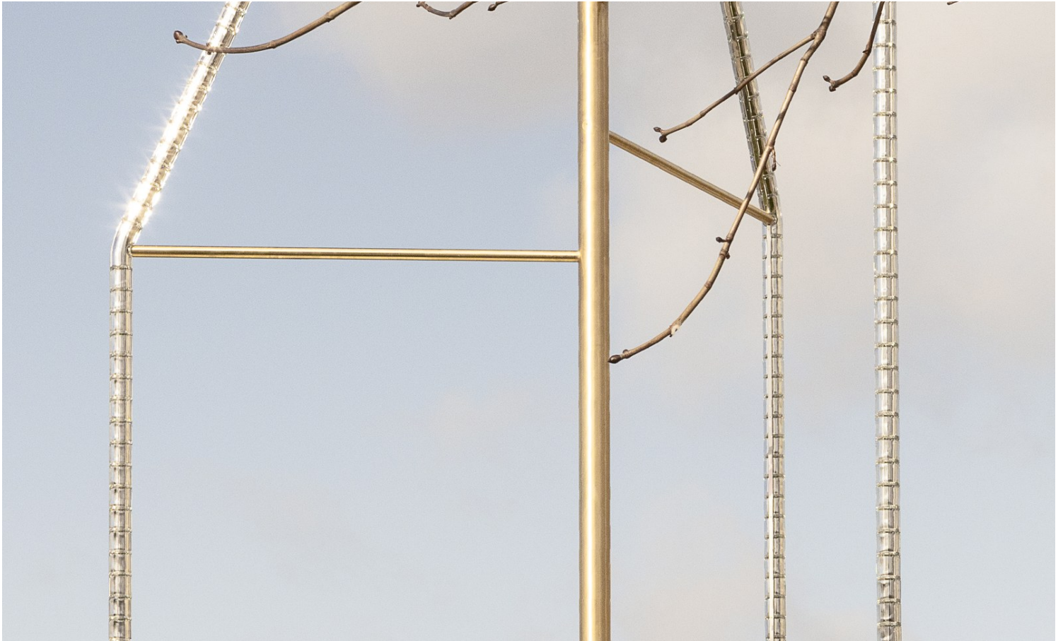
The one of the fountains seen by day.