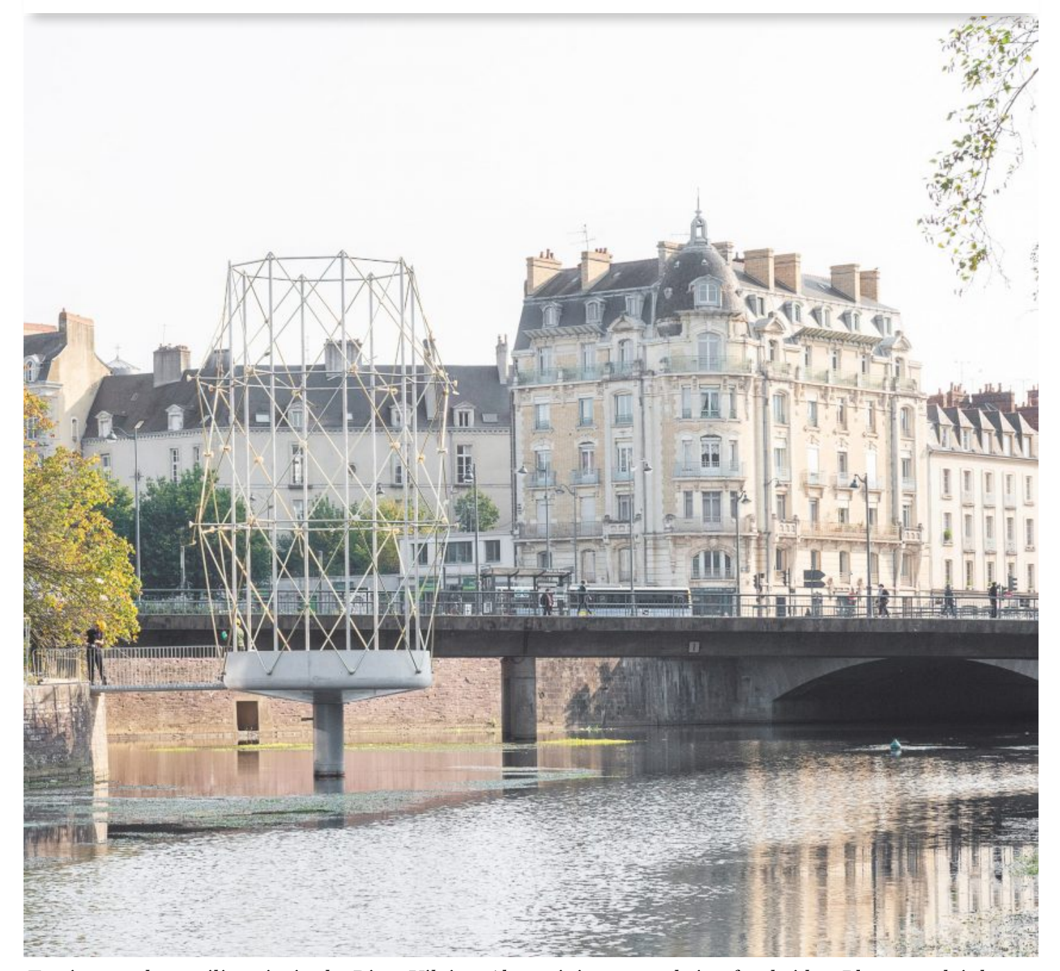
Top image: the pavilion sits in the River Vilaine. Above: it is accessed via a footbridge.

"While there are numerous interesting positions in Rennes, the clear choice, in the Vilaine, gives a particular view of the cathedral, the old town, and of the emblematic modern and contemporary buildings of Rennes: Louis Arretche's Mabilais, Georges Maillols' Horizons, as well as more recent residential projects by Jean Nouvel and Christian Hauvette," Ronan Bouroullec said.