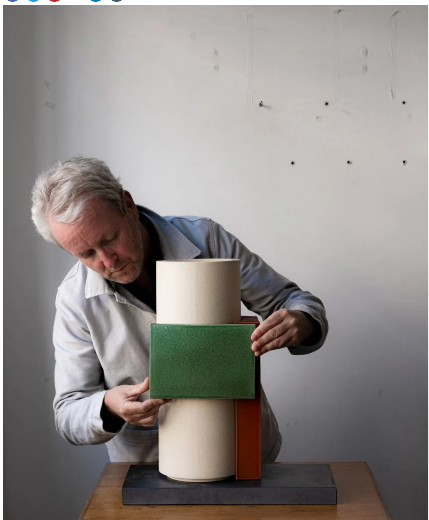
Ronan\ Bouroullec\ described\ the\ tile\ colours\ as\ "candy-like".

The \ Bouroullec \ brothers \ began \ the \ project \ with \ Tajimi \ Custom \ Tiles, \ which \ makes \ custom-designed \ tiles for architectural projects, during the coronavirus lockdown.