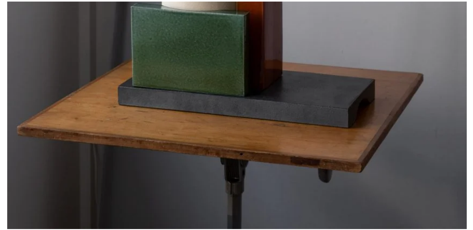
The sculptures have circular and rectangular shapes.

The collaboration between Tajimi and Ronan and Erwan Bouroullec came about after Ronan Bouroullec saw Tajimi Custom Tiles' 2020 exhibition featuring designs by Max Lamb and Kwangho Lee, which are also on display at Milan design week and were originally shown in Tokyo.